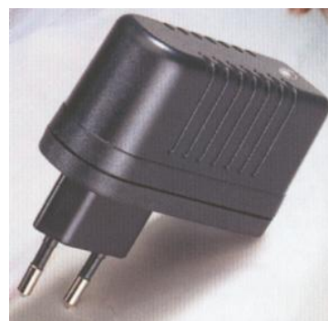
Special Medical Mains adapter for PL and CL